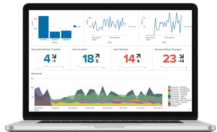
Monitor can integrate directly with your existing security stack (shown here in Splunk).